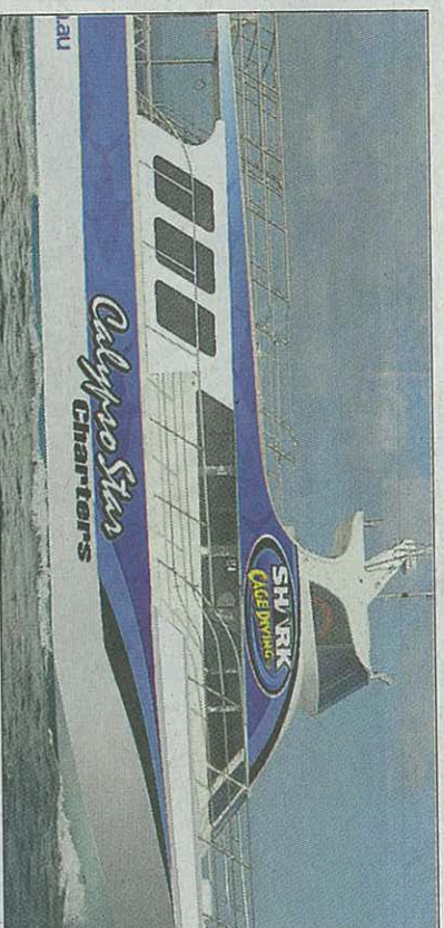
NEW BOAT: An artist's impression of the new boat that will take people out to the Neptune Islands to go diving with the sharks.

For the brave and adventurous, or just those wanting to see the sharks up close, contact Calypso Star Charters and organise a tour.