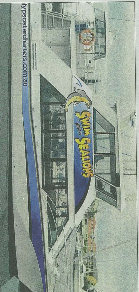
SEA LION EXPLORER: An artist's impression of the Sea Lion Explorer, which will take tours to swim with the sea lions at Hopkins Island.